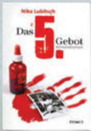
Das 5. Gebot (The 5th Commandment) 8.99€ (D) ISBN 978-3-86882-447-6

“Pure excitement!!! I devoured it in one evening, as I had previously The 7th Day and The 5th Commandment [...]”